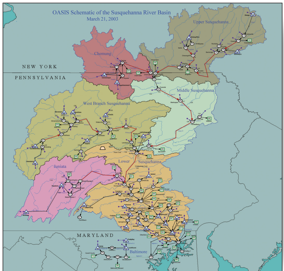
OASIS schematic of the Susquehanna basin.

After review of the initial 32 alternatives, the Workgroup developed 6 final alternatives for closer analysis leading up to the selection of a preferred operating plan. The alternatives differed mainly in operating rules for release requirements from the Conowingo dam during times of low flow. Parameters such as demand for water supply, water