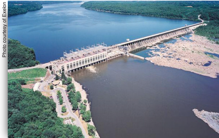
Looking north at the Conowingo dam with the pond in the upper portion.

The Conowingo pond, created by the construction of the Conowingo dam, is an interstate body of water with approximately 8 miles of the pond in Pennsylvania and 6 miles in Maryland. The dam was completed in 1928 to provide hydroelectric power generation for the Conowingo Hydroelectric Station. Operation of the dam by Exelon Generation, Inc. (Exelon) is subject to the requirements of the Federal Energy Regulatory Commission (FERC). Those requirements include provisions related to minimum flow releases and maintenance of recreational pond levels. Current minimum flows, which vary by season, were established to provide protection for fishery resources, with highest minimum flows required during the anadromous fish migratory period in spring, and intermittent flows permitted only during the winter, when fish populations are limited. By virtue of the pond, a stable source of water storage for other purposes was also provided. The Muddy Run Pumped Storage Hydroelectric Facility, built in 1968,