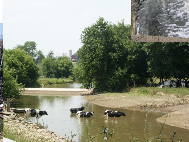
Nonpoint agricultural pollution from sediment and nutrients (above)