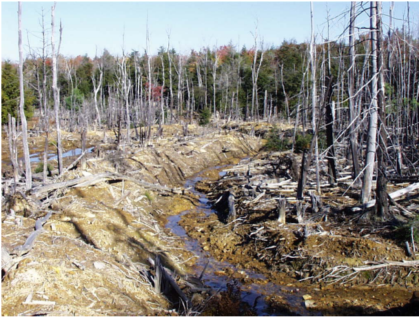
Nonpoint AMD pollution from sediment, low pH, and metals (below)