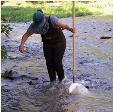
A scientist places a special net against the stream bottom to collect macroinvertebrates. She disturbs the area upstream with her feet, and the macroinvertebrates float downstream into the net.

Streams with a lot of different kinds of benthic macroinvertebrates are usually very healthy. Unhealthy streams will have only a few benthic macroinvertebrates or a lot of only a few kinds.