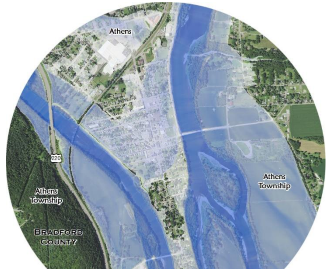
The map above shows the extent and depth of a flood resulting from stage 31.6' (record flood stage) at Athens, PA.

River Flooding: The National Weather Service (NWS) issues river forecasts based on expected rainfall and river conditions in the watershed. Based on the forecast from NWS, you can view a map that most closely resembles the predicted extent of the flood.