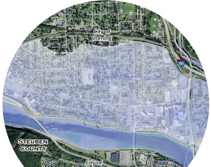
The map above shows the extent and depth of a flood resulting from stage 40.7' (record flood stage) at Corning, NY.

River Flooding: The National Weather Service (NWS) issues river forecasts based on expected rainfall and river conditions in the watershed. Based on the forecast from NWS, you can view a map that most closely resembles the predicted extent of the flood.