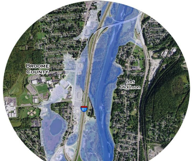
The map above shows the extent and depth of a flood resulting from stage 20.3' (record flood stage) at Port Dickinson, NY.

River Flooding: The National Weather Service (NWS) issues river forecasts based on expected rainfall and river conditions in the watershed. Based on the forecast from NWS, you can view a map that most closely resembles the predicted extent of the flood.