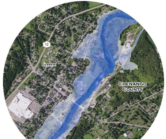
The map above shows the extent and depth of a flood resulting from stage 22.0' (record flood stage) at Greene, NY.

River Flooding: The National Weather Service (NWS) issues river forecasts based on expected rainfall and river conditions in the watershed. Based on the forecast from NWS, you can view a map that most closely resembles the predicted extent of the flood.