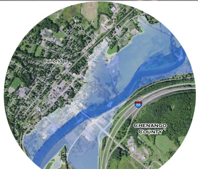
The map above shows the extent and depth of a flood resulting from stage 27.1' (record flood stage) at Bainbridge, NY.

River Flooding: The National Weather Service (NWS) issues river forecasts based on expected rainfall and river conditions in the watershed. Based on the forecast from NWS, you can view a map that most closely resembles the predicted extent of the flood.