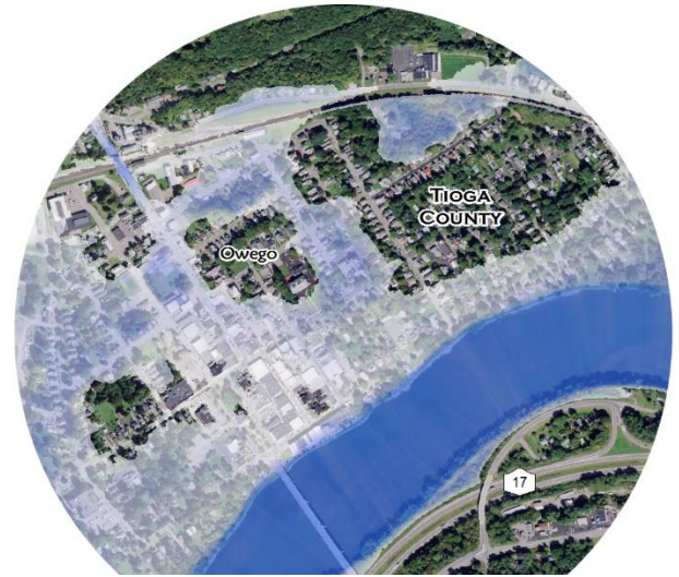
The map above shows the extent and depth of a flood resulting from stage 39.6' (record flood stage) at Owego, NY.

River Flooding: The National Weather Service (NWS) issues river forecasts based on expected rainfall and river conditions in the watershed. Based on the forecast from NWS, you can view a map that most closely resembles the predicted extent of the flood.