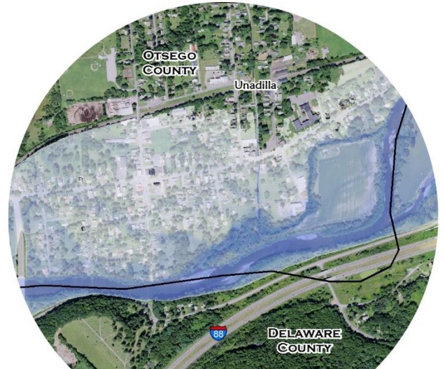
The map above shows the extent and depth of a flood resulting from stage 17.7' (record flood stage) at Unadilla, NY.

River Flooding: The National Weather Service (NWS) issues river forecasts based on expected rainfall and river conditions in the watershed. Based on the forecast from NWS, you can view a map that most closely resembles the predicted extent of the flood.