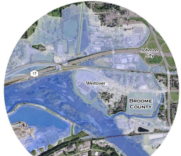
The map above shows the extent and depth of a flood resulting from stage 35.3' (record flood stage) at Johnson City, NY.

River Flooding: The National Weather Service (NWS) issues river forecasts based on expected rainfall and river conditions in the watershed. Based on the forecast from NWS, you can view a map that most closely resembles the predicted extent of the flood.