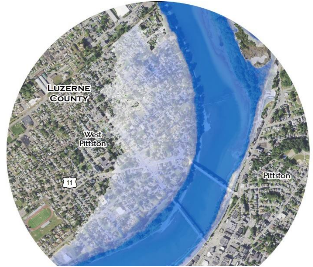
The map above shows the extent and depth of a flood resulting from stage 42.7' (record flood stage) at West Pittston, PA.

River Flooding: The National Weather Service (NWS) issues river forecasts based on expected rainfall and river conditions in the watershed. Based on the forecast from NWS, you can view a map that most closely resembles the predicted extent of the flood.