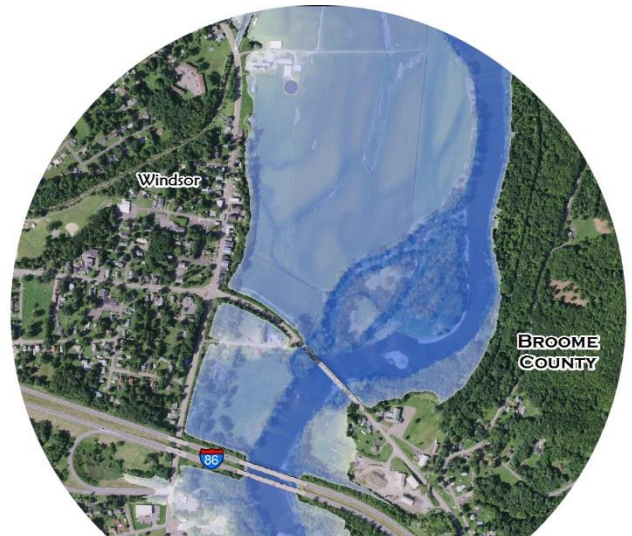
The map above shows the extent and depth of a flood resulting from stage 24.3' (record flood stage) at Windsor, NY.

River Flooding: The National Weather Service (NWS) issues river forecasts based on expected rainfall and river conditions in the watershed. Based on the forecast from NWS, you can view a map that most closely resembles the predicted extent of the flood.