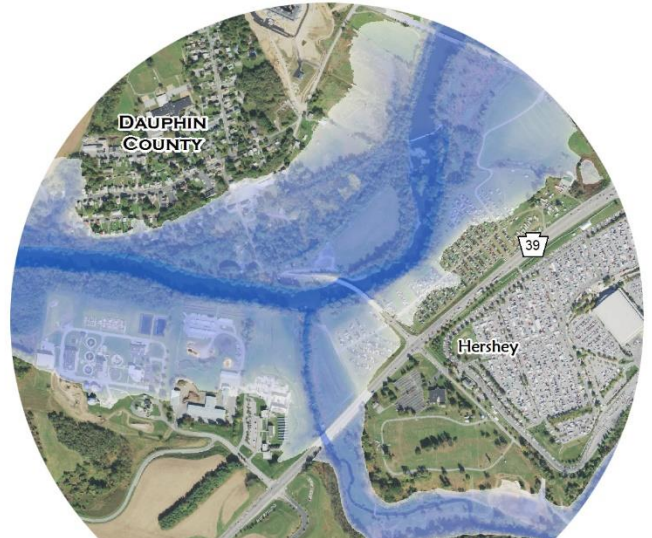
The map above shows the extent and depth of a flood resulting from stage 26.8' (record flood stage) at Hershey, PA.

River Flooding: The National Weather Service (NWS) issues river forecasts based on expected rainfall and river conditions in the watershed. Based on the forecast from NWS, you can view a map that most closely resembles the predicted extent of the flood.