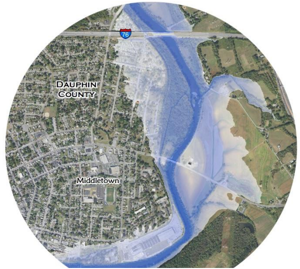
The map above shows the extent and depth of a flood resulting from stage 23.3' (record flood stage) at Middletown, PA.

River Flooding: The National Weather Service (NWS) issues river forecasts based on expected rainfall and river conditions in the watershed. Based on the forecast from NWS, you can view a map that most closely resembles the predicted extent of the flood.