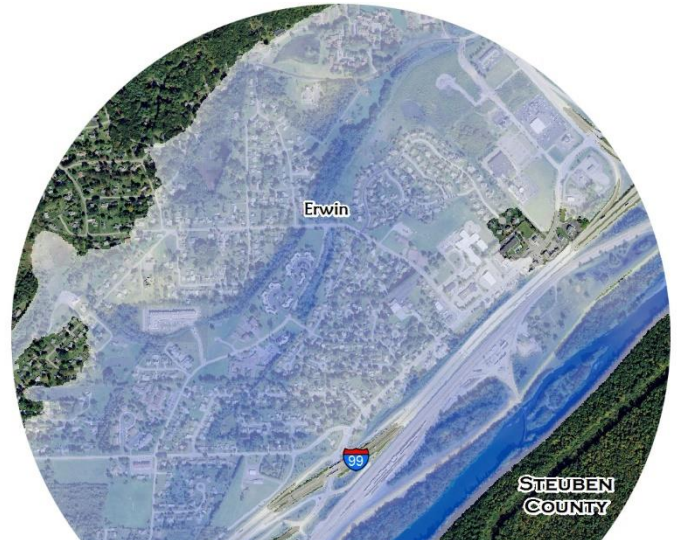
The map above shows the extent and depth of a flood resulting from stage 26.7' (record flood stage) at Erwin, NY.

River Flooding: The National Weather Service (NWS) issues river forecasts based on expected rainfall and river conditions in the watershed. Based on the forecast from NWS, you can view a map that most closely resembles the predicted extent of the flood.