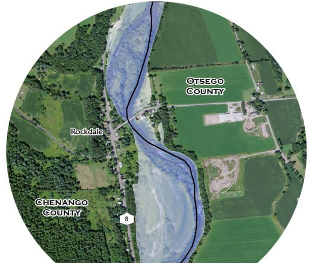
The map above shows the extent and depth of a flood resulting from stage 14.2' (record flood stage) at Rockdale, NY.

River Flooding: The National Weather Service (NWS) issues river forecasts based on expected rainfall and river conditions in the watershed. Based on the forecast from NWS, you can view a map that most closely resembles the predicted extent of the flood.